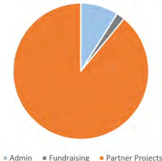
Animal Aid Abroad Expenditure 2019-2020

We work hard to keep our expenses to an absolute minimum so your donation has the most impact and effect to help working animals in need.